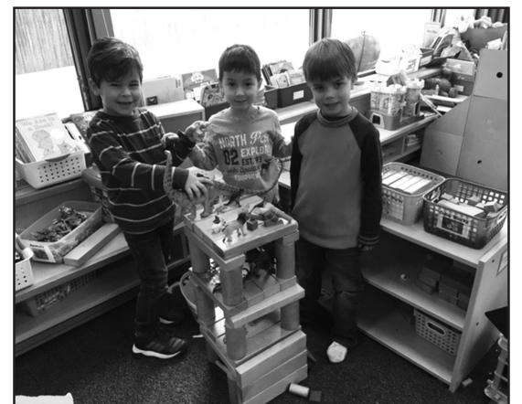
McKenzie kindergarten students love to explore!