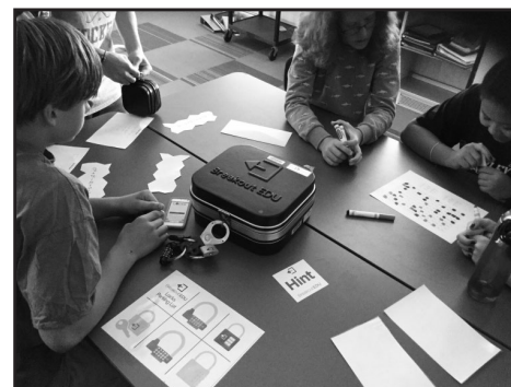
WJHS students collaborate to find the solution to the Breakout EDU box awarded through a Foundation Gripp Grant