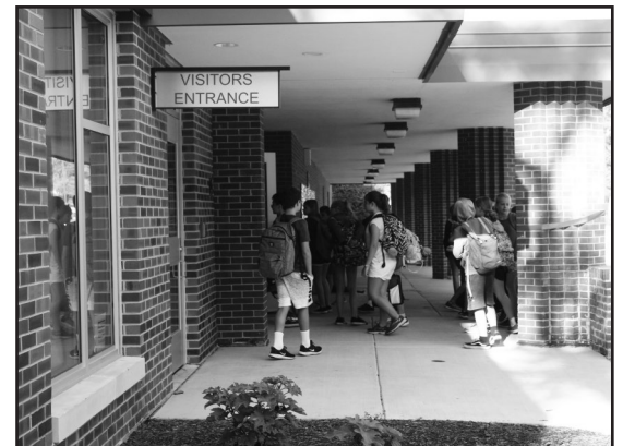
Construction at HMS provided a new visitor entrance with improved security, as well as new offices and a staff lounge.